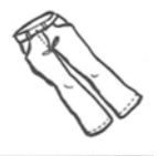
a pair of trousers