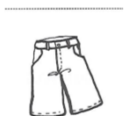
a pair of shorts